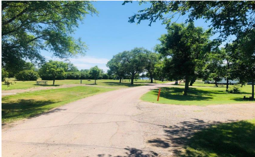
The Bay campground

We extend a warm welcome to all participants attending the 50 th Anniversary International Indian Treaty Conference. We are providing you with the following important information to help make the conference a good experience for everyone.