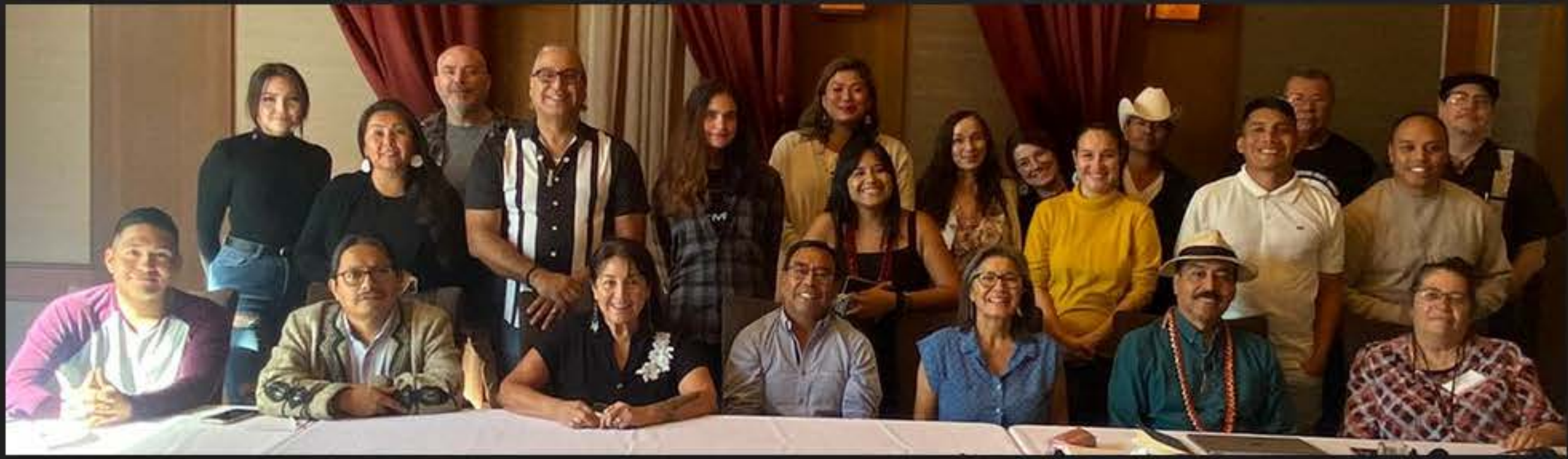
IITC Strategic Planning staff meeting, October 10-12, 2023, Thunder Valley Casino and Resort, United Auburn Indian Community, Lincoln California.