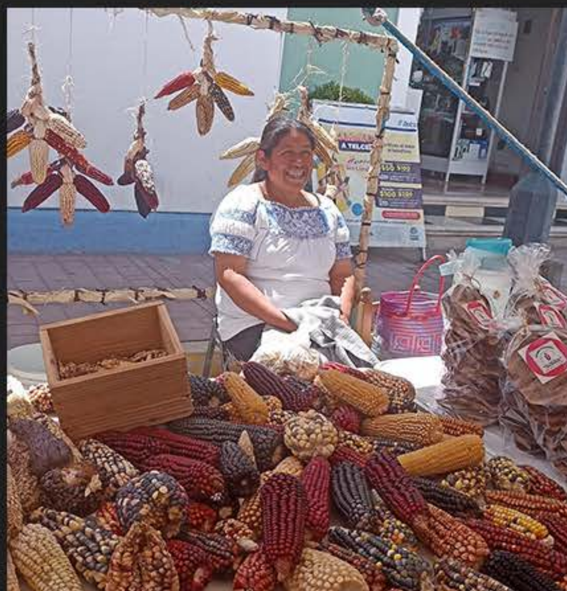
IITC Co-sponsored the 25th Annual "Corn and other Native Seeds Fair" with IITC affiliate Proyecto de Desarrollo Rural Integral Vicente Guerrero in Tlaxcala Mexico, March 11th -12th.