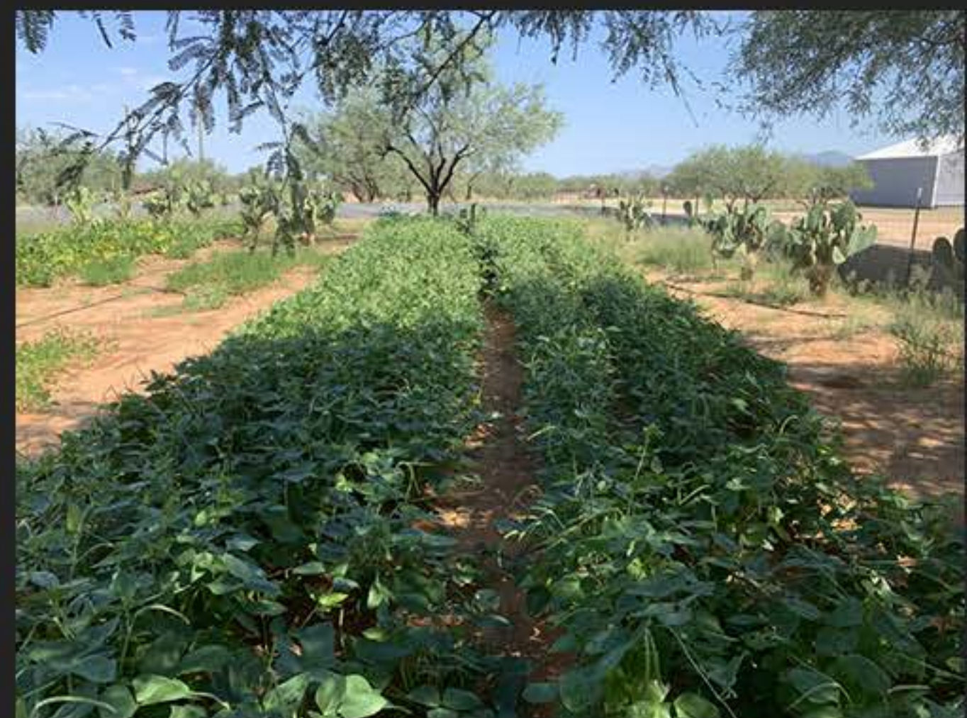
IITC knowledge holders at COP 28 presented Indigenous practices for eco- and food system restoration and climate resiliency, including water system restoration methods carried out by the Nation of Hawaii and practices to protect and maintain soil health used by Yaqui farmers in the Sonora Desert.