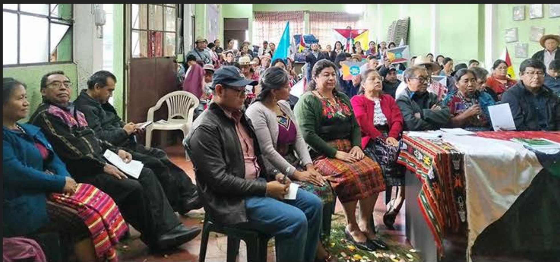
(Above) IITC's Tucson Office hosted the launch of a Collaborative Research Project on “Protected Areas and the Rights of Indigenous Peoples” on February 14th.