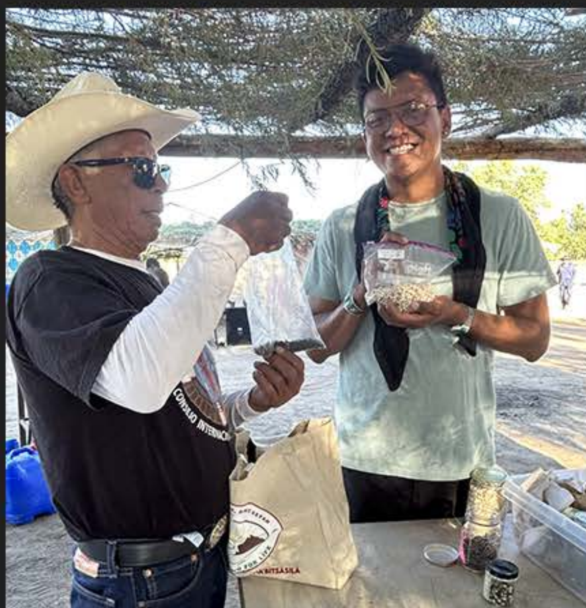
Yaqui and Diné farmers shared drought resistant seeds at the 6th International Indigenous Peoples Corn Conference to build resiliency to climate change, September 30th.