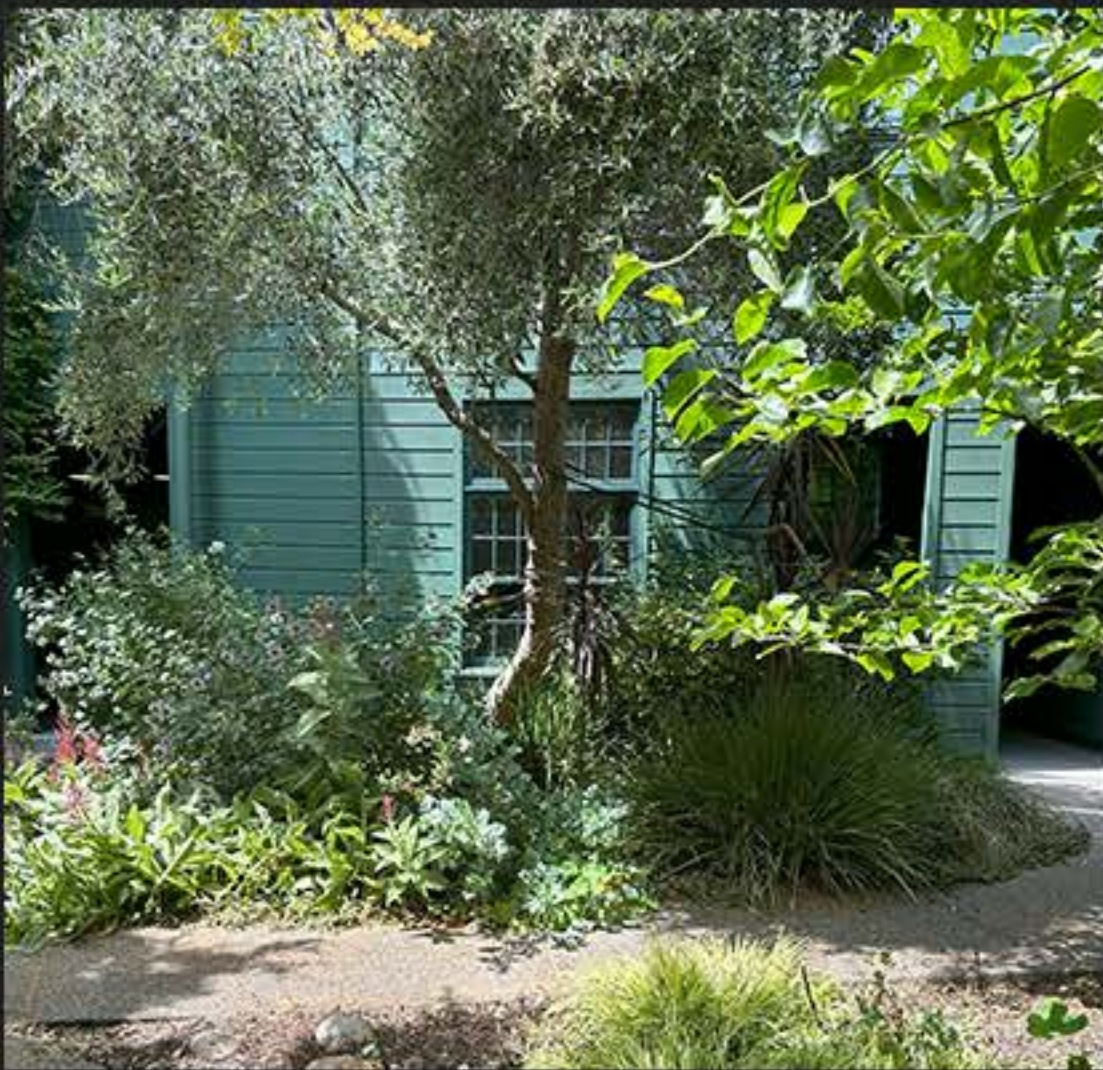
IITC's new San Fransico Office on Folsom Street.

In 2023, IITC continued to carry out its work from offices in Tucson, Arizona, San Francisco, California and Guatemala City, Guatemala hosted by IITC Affiliate the National Coordination of Guatemalan Widows (CONAVIGUA). IITC was excited to move our San Francisco Office back to Folsom Street in the Mission District, the “American Indian Cultural District” in June 2023.