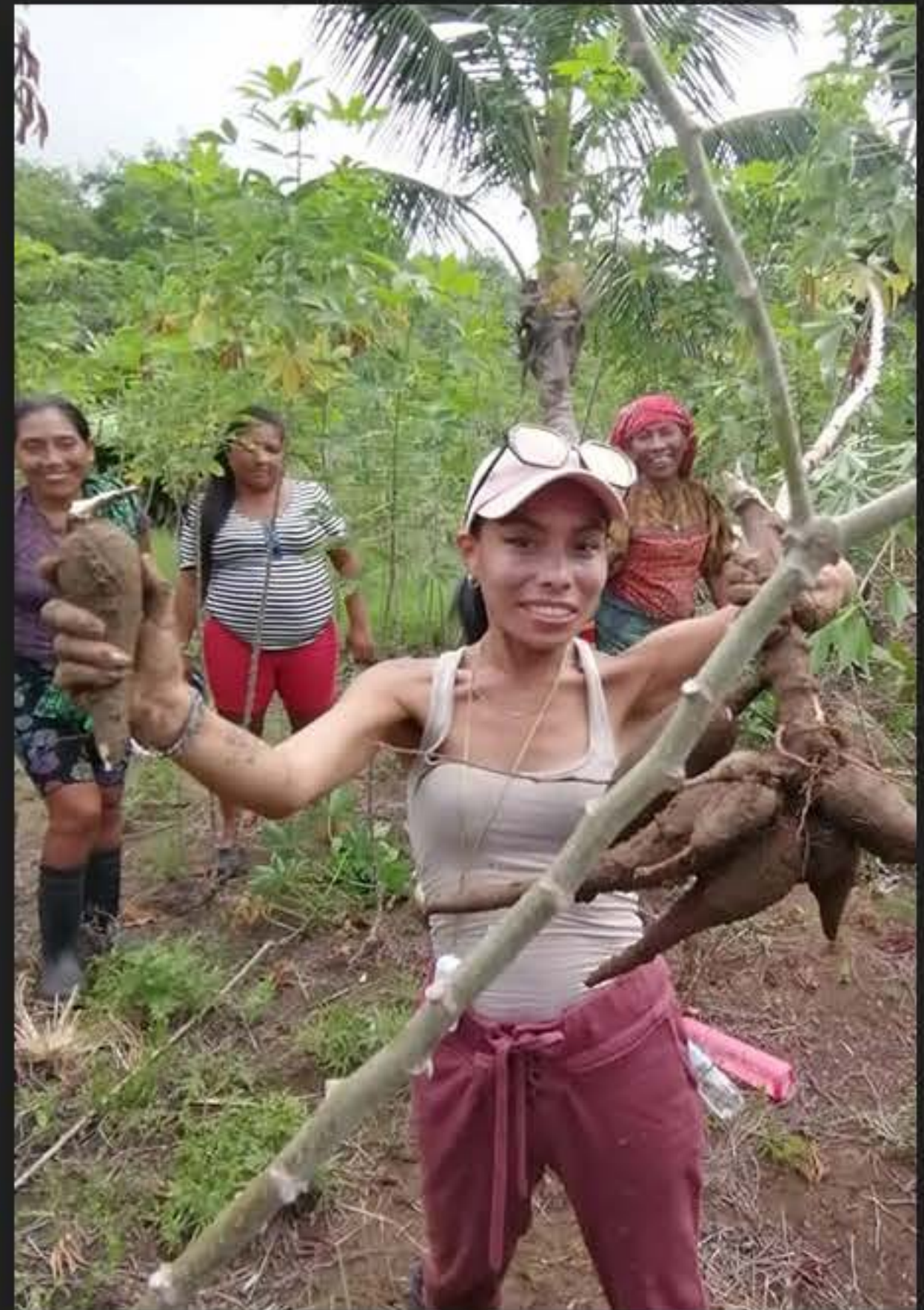
(Above) Kuna Youth Movement members harvesting Yucca in the Niadip Community Farm, October 7th.