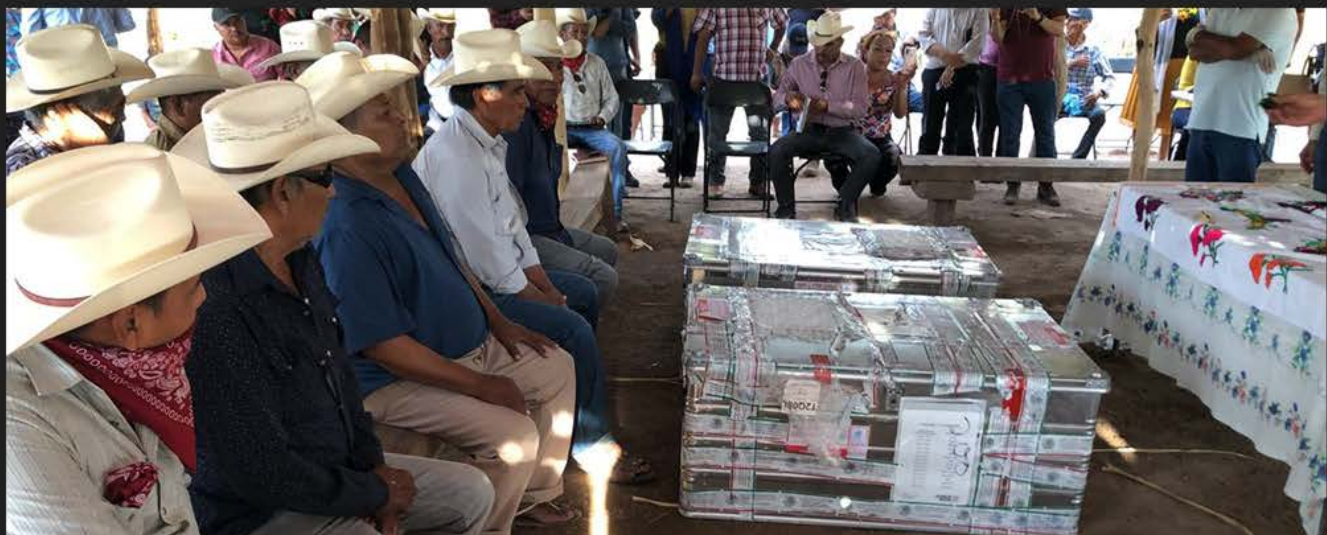
The Sacred Maaso Kova and other ceremonial items were finally returned from Sweden to the Yaqui Nation, Vicam Pueblo, Rio Yaqui, Mexico on July 12th.