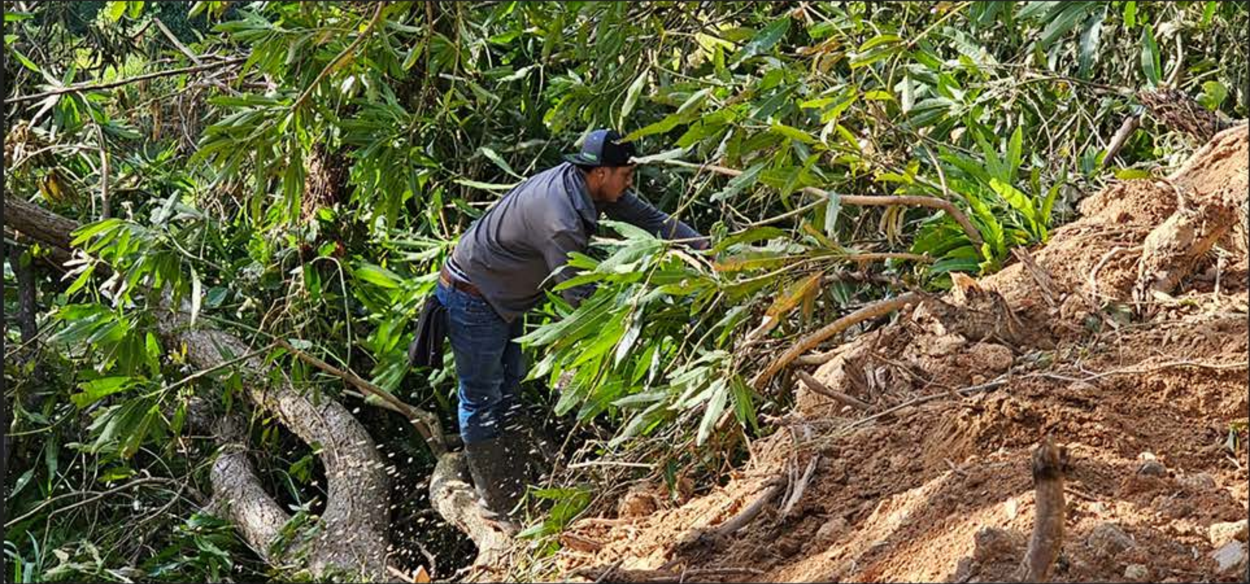
Taino community member clearing land for UCTP Konuko (traditional garden) Project in Mayaguez, Boriken (Puerto Rico), September 16th.