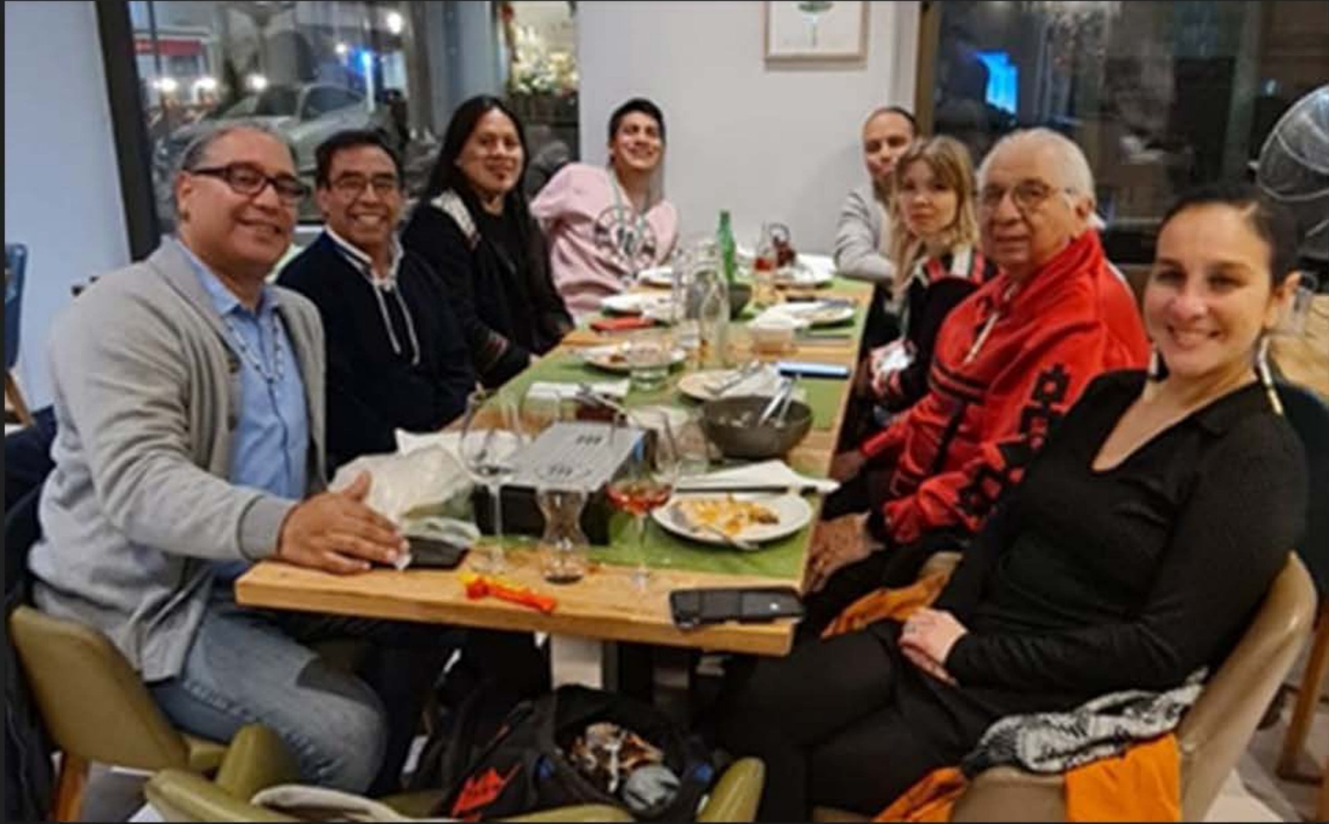
IITC delegates with Saami Quechua and Haudenosaunee allies at the Convention on Biological Diversity Article 8j Workshop in Geneva November 13th.